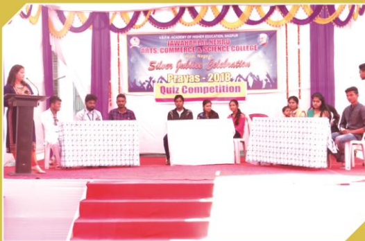
Quiz Competition for college students.