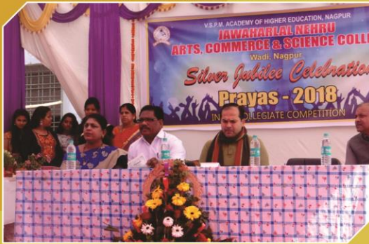
Honourable Shri Amol Deshmukh, Chief Guest of the function.