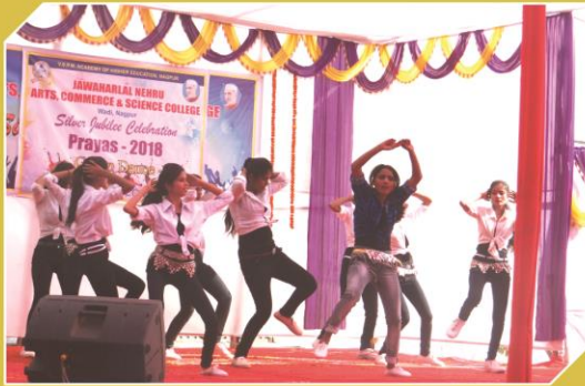
Dance Competition for college students