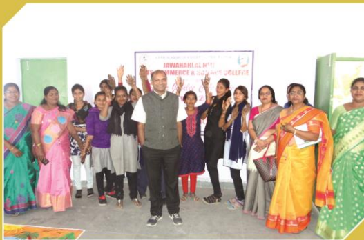
Inter college Mehendi Competition for college students.